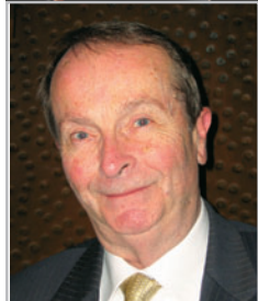
By Bruce H. Hulme, CFE

As the outgoing 110th Congress deals with multiple issues related to the current financial meltdown, none of the federal bills related to the security industry has been passed, nor is expected to before the new Congress convenes.